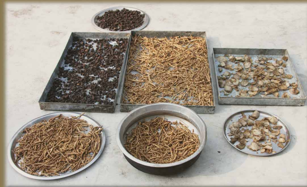
Sun Dried Plant Materials

Eliminates the possibility of fungal contamination. Facilitates powdering through pounding. Increases shelf life for storage. Concentrates the healing qualities of the plant.