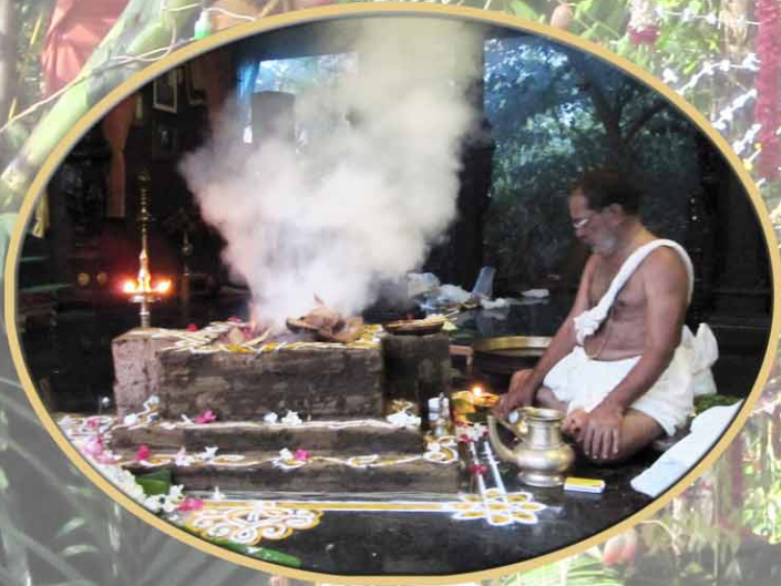
Pre-Dawn Ganapathi Homa