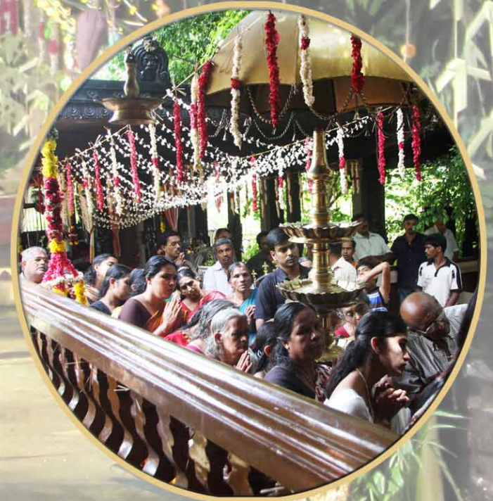
Devotees attentively observing Pushpabhishekam