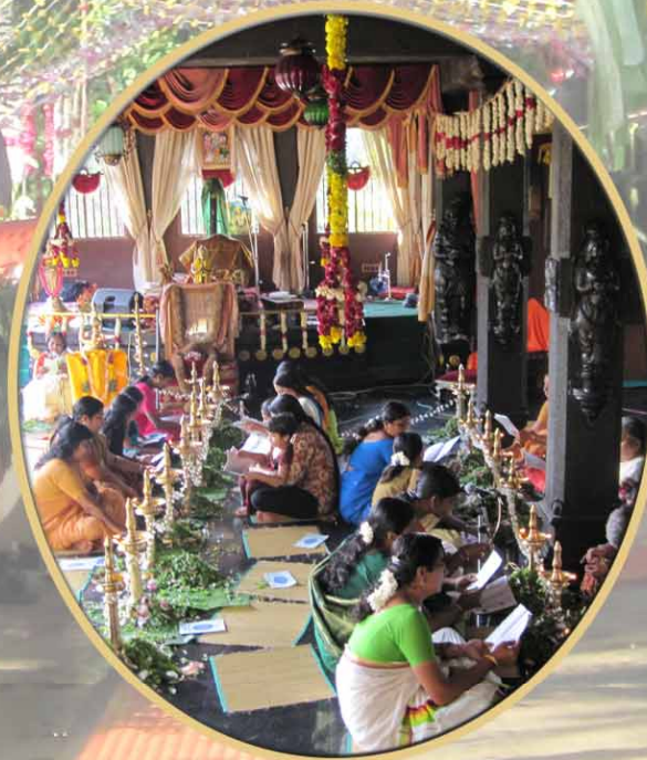
100,000 Mantra Pooja