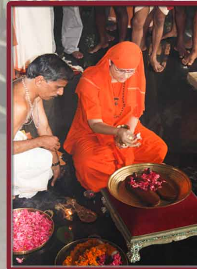
Performing Padma Pooja