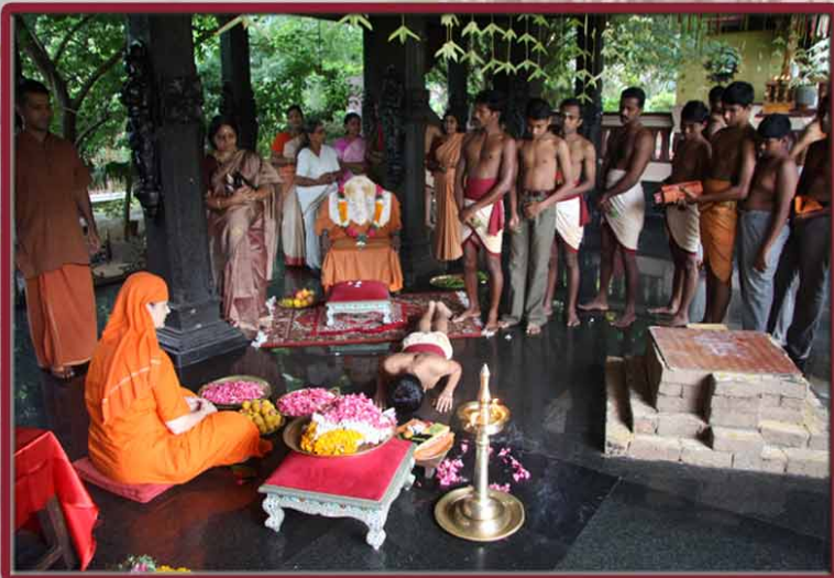
Ashram Devotees Paying Homage to the Guru